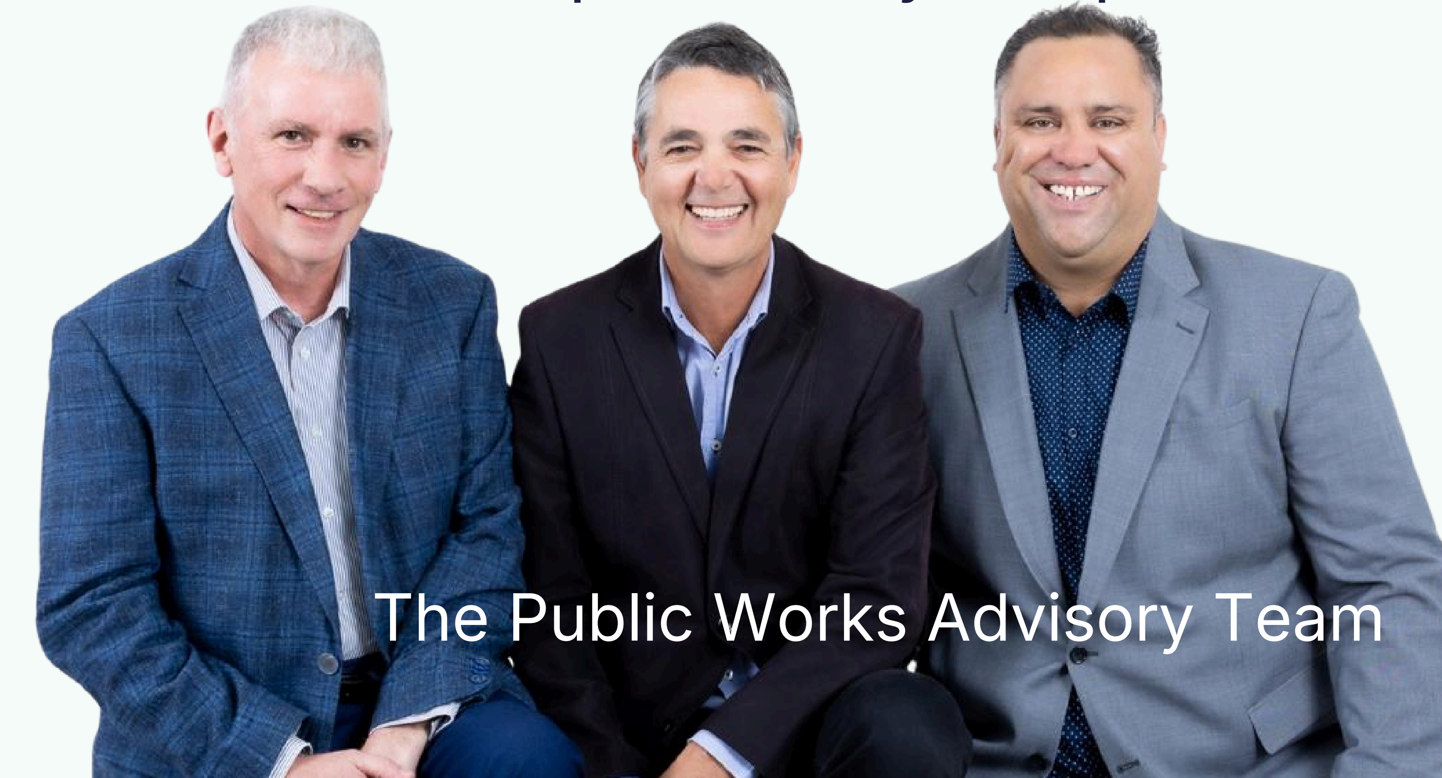
The Public Works Advisory Team

Specialist lawyers and valuers also in attendance to help answer your questions